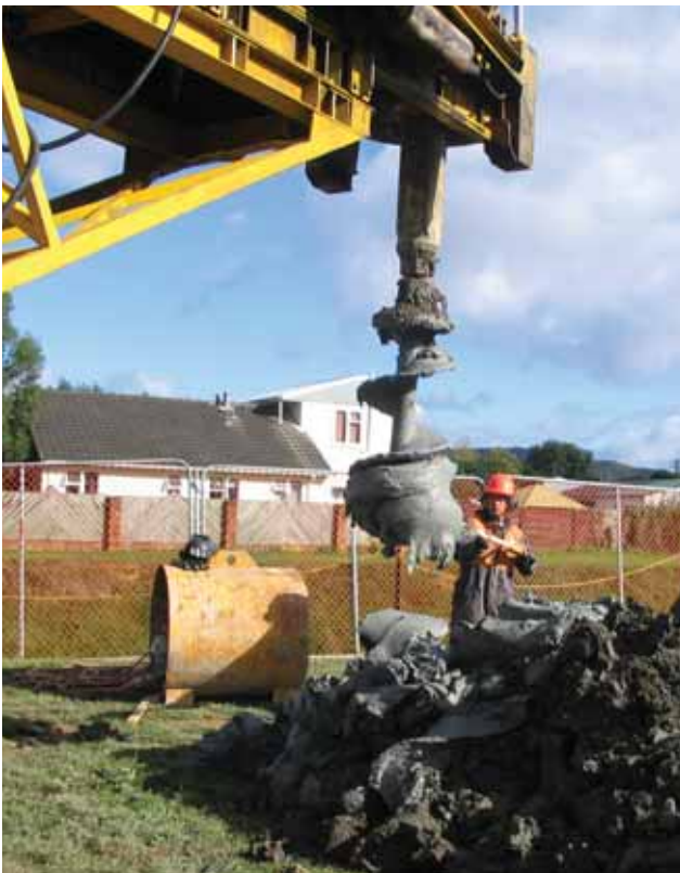
Above: Pile drilling has commenced at Best Street Bridge.

Stage two in 2007 was to widen the main Black Creek channel between the Parkway Drain and the Nelson Crescent Bridge, the Parkway Drain as far as the Konini Drain and the Konini Drain up to Konini Street.